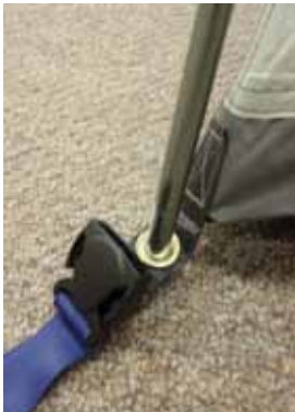
Grommet Pole Placement

Step 2: Insert the pole tips of the hoop poles into the grommets at each corner of the tent. Lay the hoop pole to inside of tent. Attach ball cap connectors to end of X pole.