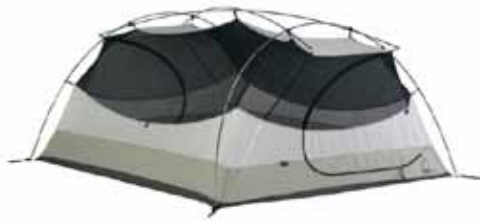
Zia 3 pictured

Package Includes: Tent Body, Rain Fly, 2 Hoop poles, 1 X hub ridge pole, 4 Guy Cords, 6 Ground Stakes, 1 Pole Sack with stake pocket.