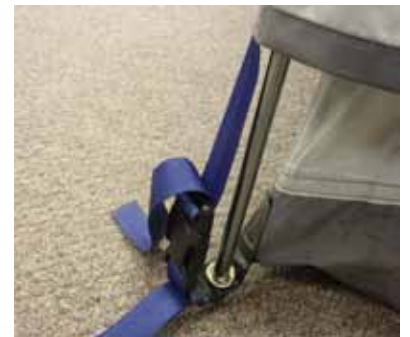
Rain Fly Attachment