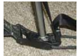
Jake's Foot™ Fly Attachment