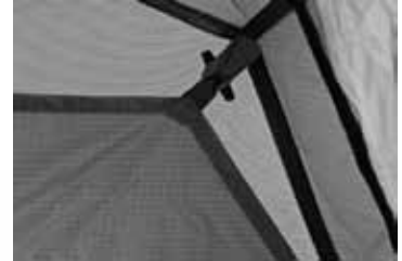
Vent closure toggle