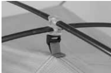
Swivel Hub™ with H-Clip